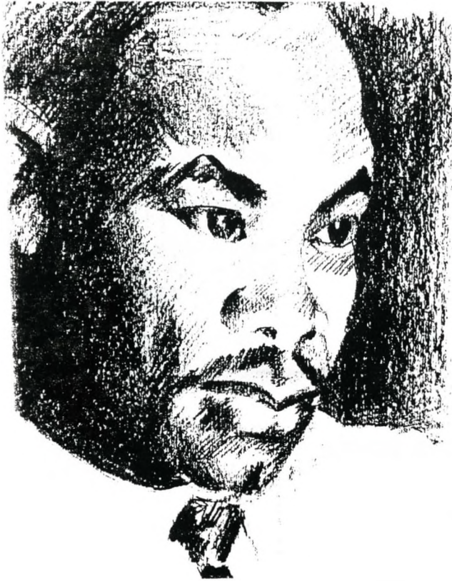
Martin Luther King, Jr. 1929-1968

When he was only twenty-six years old, King told those gathered at the first meeting of the Montgomery bus boycott, "If you will protest courageously, and with dignity and Christian love, when the history books are written in future generations, the historians will have to pause and say, 'There lived a great people--a black people--who injected new meaning into the veins of civilization.' This is our challenge and our overwhelming responsibility."