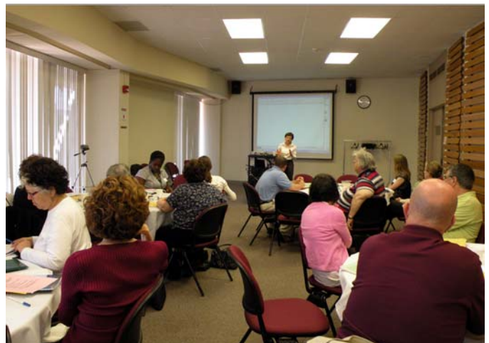
Faculty Institute, May 19-21