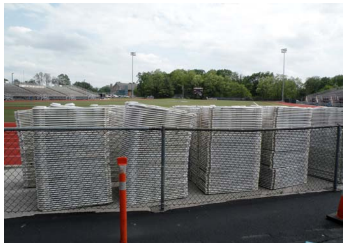
Preparations for Commencement