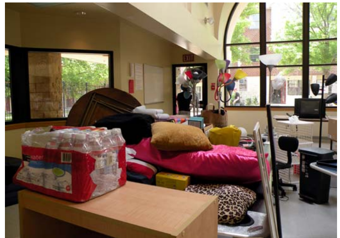
Food and furnishings left by departing students on the last day of finals and donated to NeighborGoods , who will distribute them to local organizations