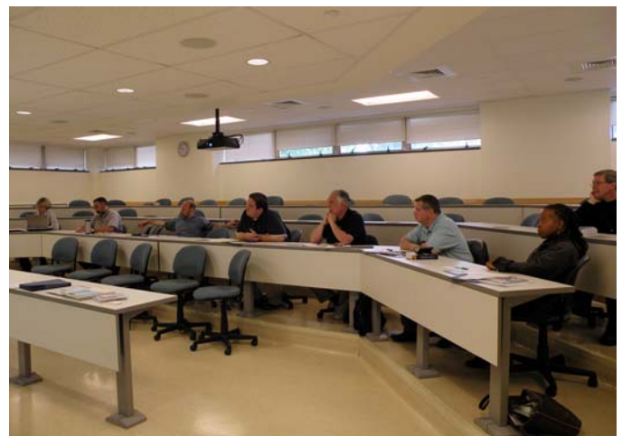
Science Technology Workshop in St. Benilde Tower, May 12