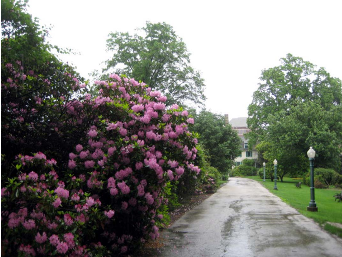
Rhododendrons in full bloom along the walkway to the Peale House