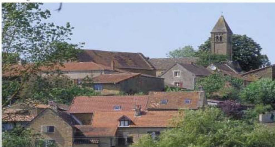
Taizé, France, is the home of the international, ecumenical monastic community founded by Brother Roger in 1940.