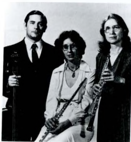
The Huntingdon Trio