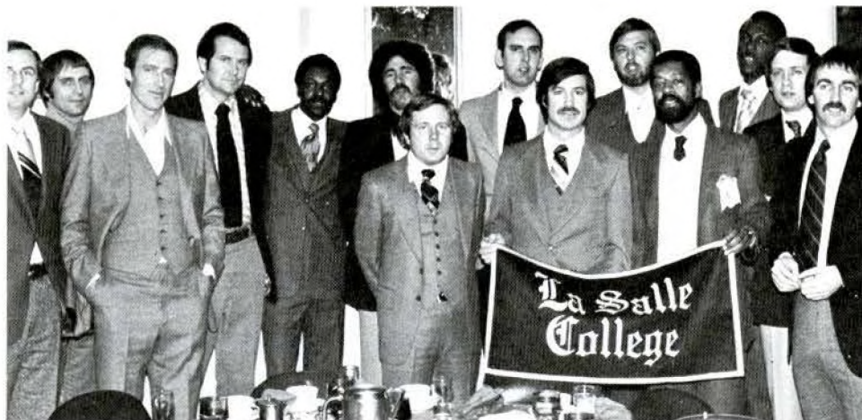
The 1969 team (23-1) met at a dinner for alumni and friends at the Engineers Club on February 10 before their "old timers" game with Temple's '69 N.I.T. championship team played at the Palestra prior to the Big 5 varsity game.