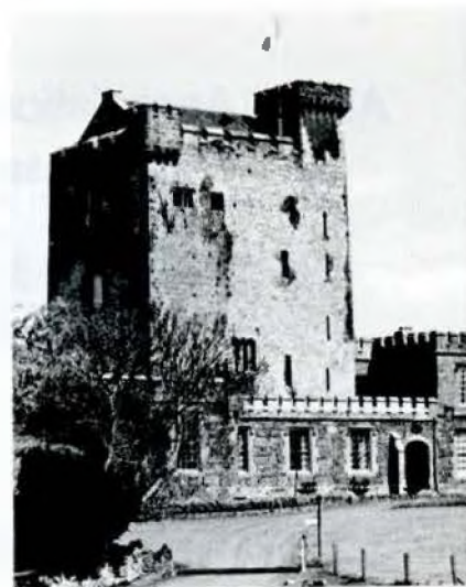
Knappogue Castle, Ireland

AUGUST — Hawaii (August 23-31) $389 plus $60. Nova Scotia (Aug. 28-September 5) $527.