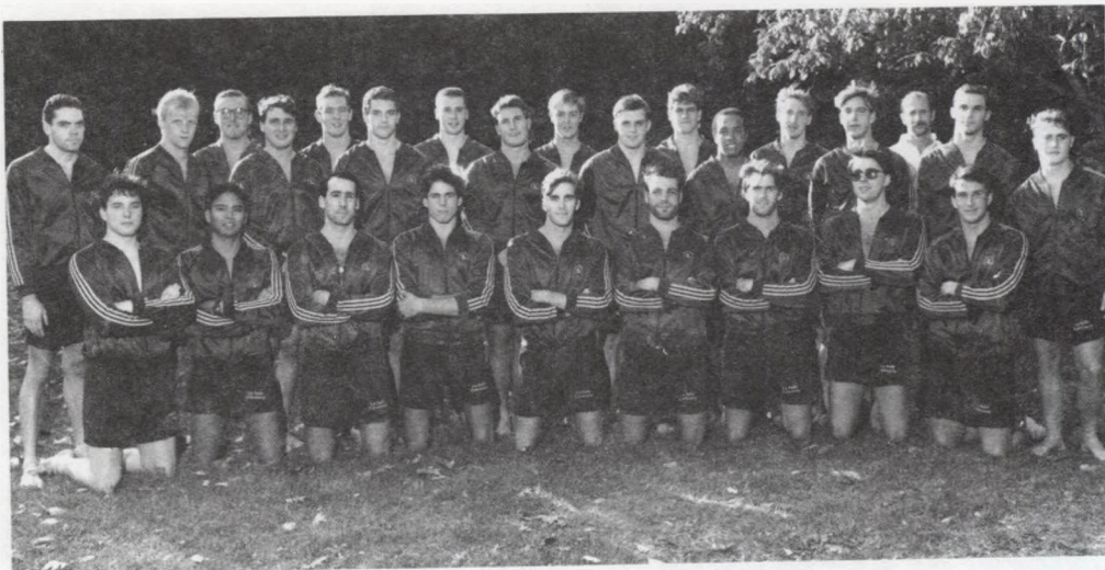
The men's swimming team captured their sixth MAAC Championship.

The rest of the field finished as follows: Canisius, Fairfield, Manhattan, and St. Peter's (73.5), Siena (72.0), Iona (69.0), Loyola (66.0) and Niagara (44.5).