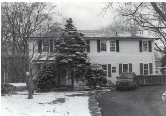
Mutien Hall - home for new community

Mutien Hall, a Civil War era country house, was the former residence of the Basilian Sisters who staffed St. Basil's Academy.