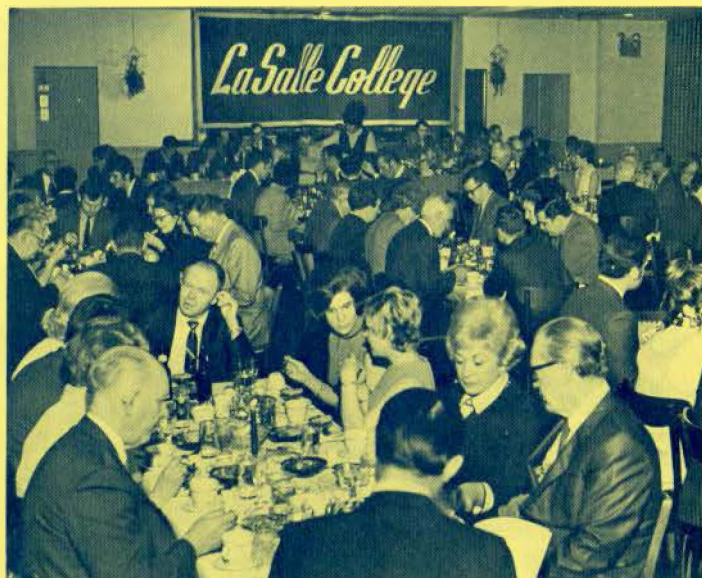
Basketball Awards dinner, 1970