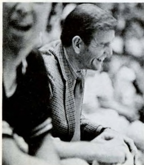
Wise men never sit and wail their loss, but cheerily seek how to redress their harms. (Henry IV, v, 4, 1)

Sat. 3 Syracuse University Away Wed. 7 Canisius College PALESTRA Sat. 10 Univ. of Notre Dame Away Mon. 12 Drexel University Away Sat. 17 Temple University PALESTRA Wed. 21 The American Univ. Away 28 Villanova University PALESTRA Fri. 2 M.A.C.'s PALESTRA Sat. 3