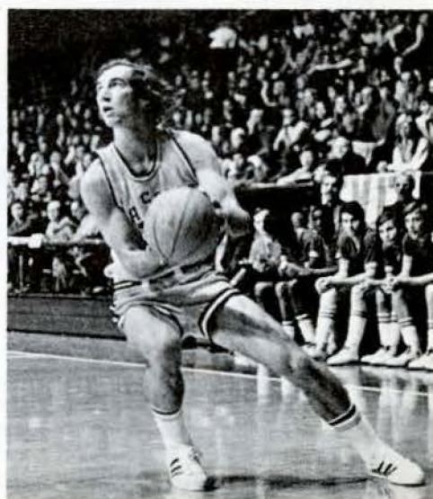
Some are born great, some achieve greatness, and some have greatness thrust upon them. . . (Twelfth Night, ii, 5, 158)