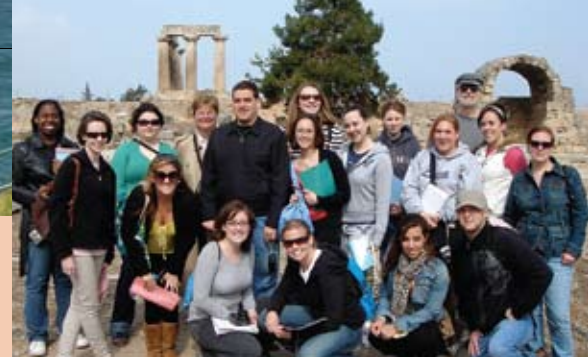
A travel/study class visits Corinth, Greece.