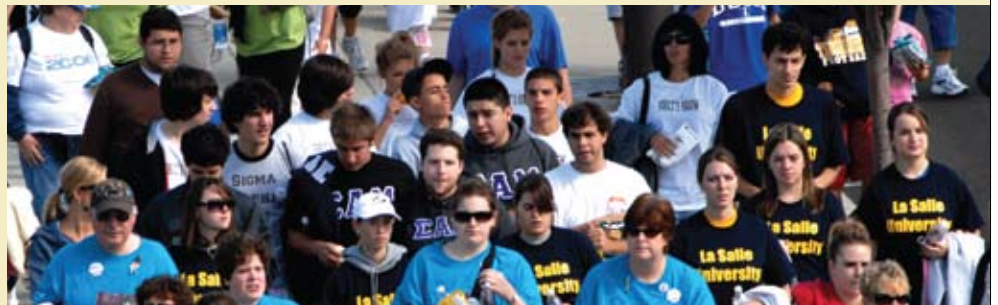
More than 40 La Salle students and faculty united in support of Walk Now for Autism in September 2008.

On May 1, La Salle will host an academic conference with co-sponsor Green Tree Partnerships titled “ASD: Perspectives